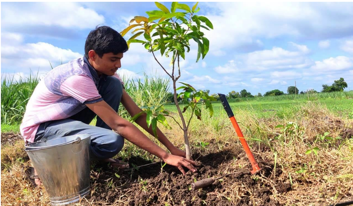
National Level Tree plantation