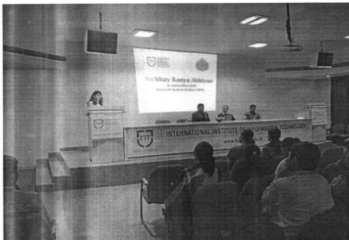
Photograph of ‘Nirbhay Kanya Abhiyan’