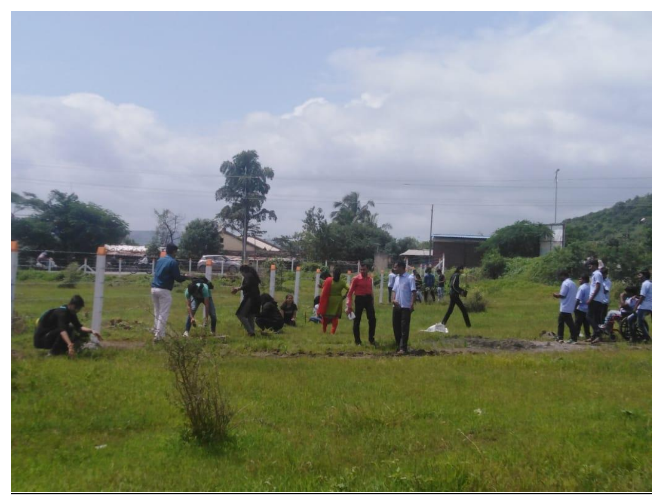
TREE PLANTATION AT APANG SHALA, MAAN GAON VILLAGE