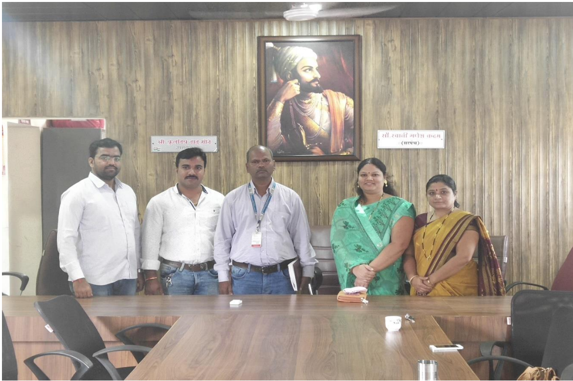
Meeting with sarpanch office