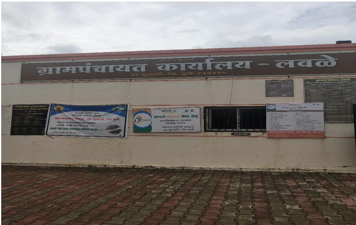
GRAMPANCHAYAT OFFICE AT LAVALE