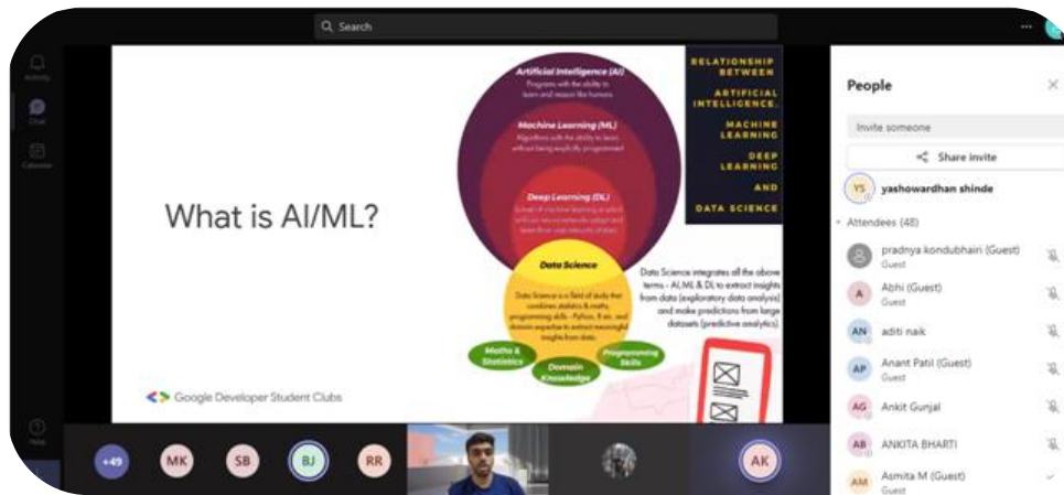
GDSC Webinar on Know your domain AI/ ML Edition