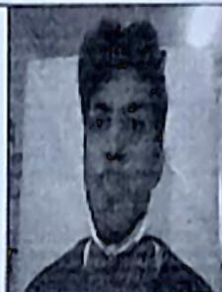
Test Day Photo