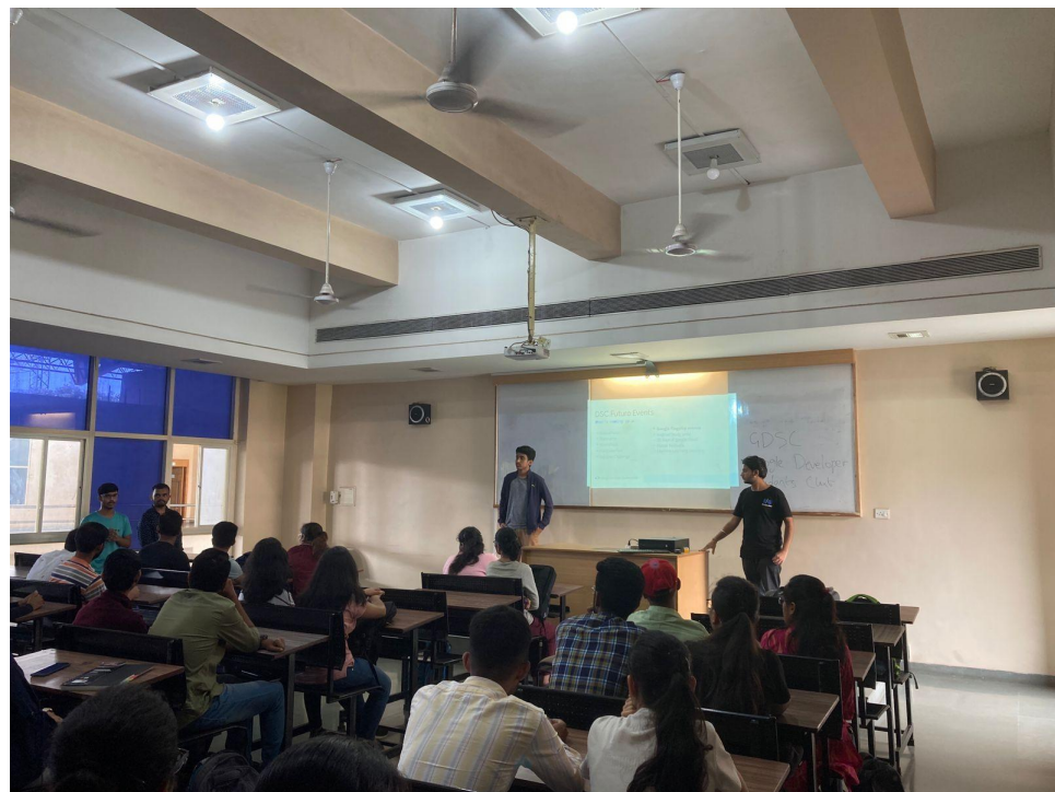
Info. Session at IT branch.