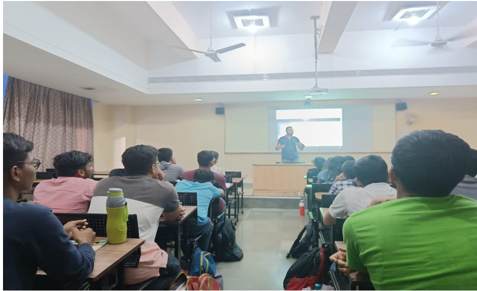
Info. Session at Computer branch.