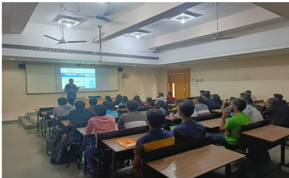
Info. Session at Computer branch.