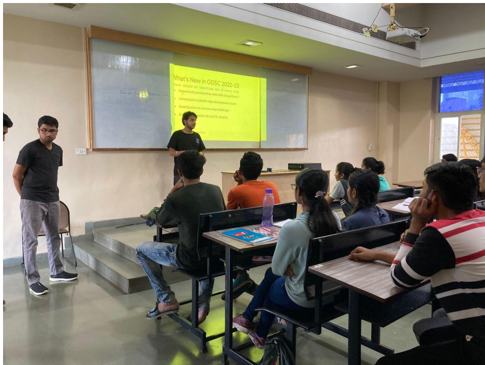
Info. Session at IT branch.