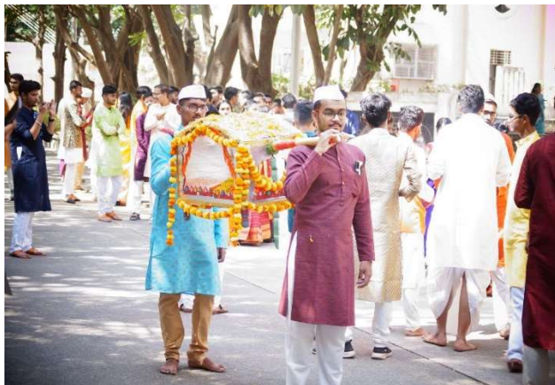
Traditional Day- Granth Dindi