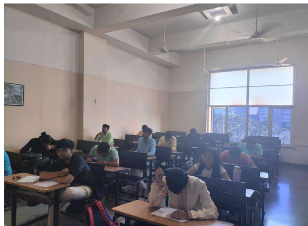
Spree of Coding