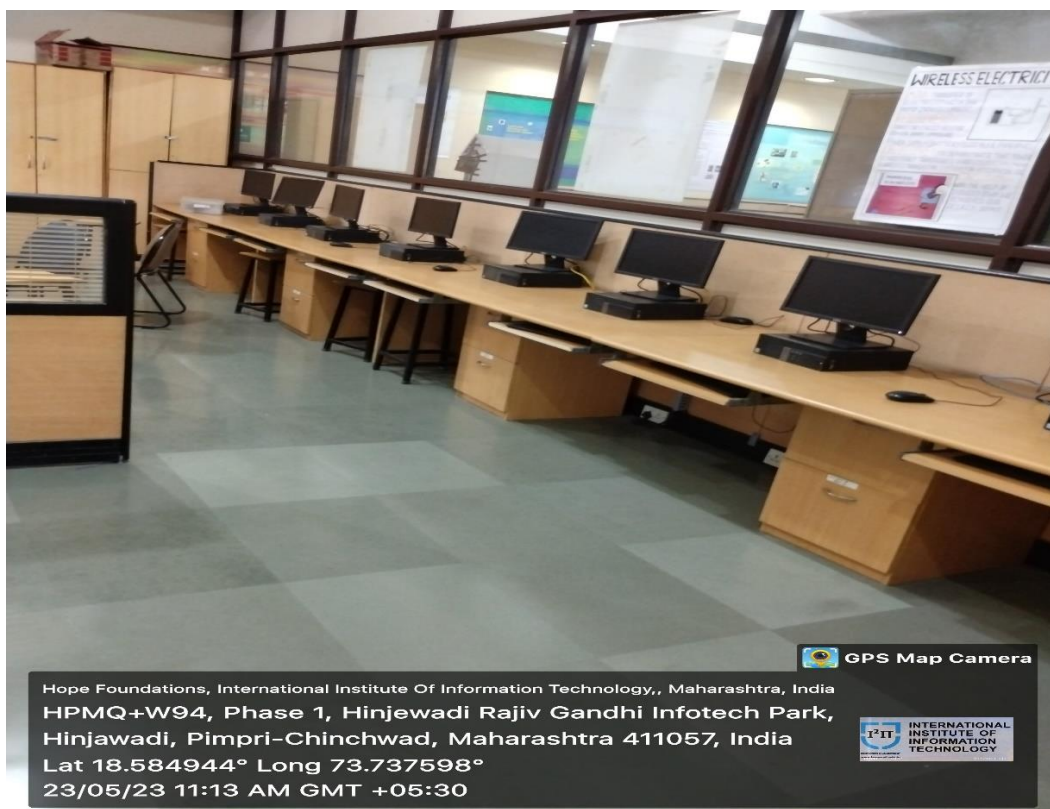
Embedded Systems Laboratory