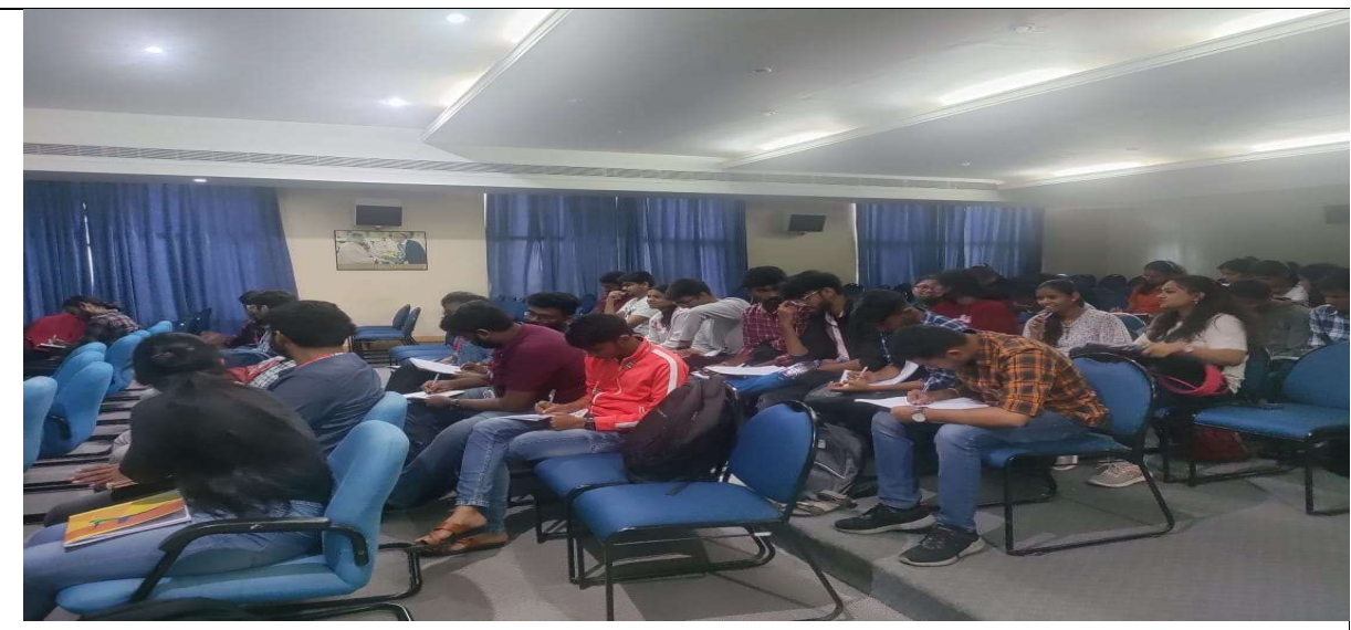
Image 2: Students performing task for various design practices in technology