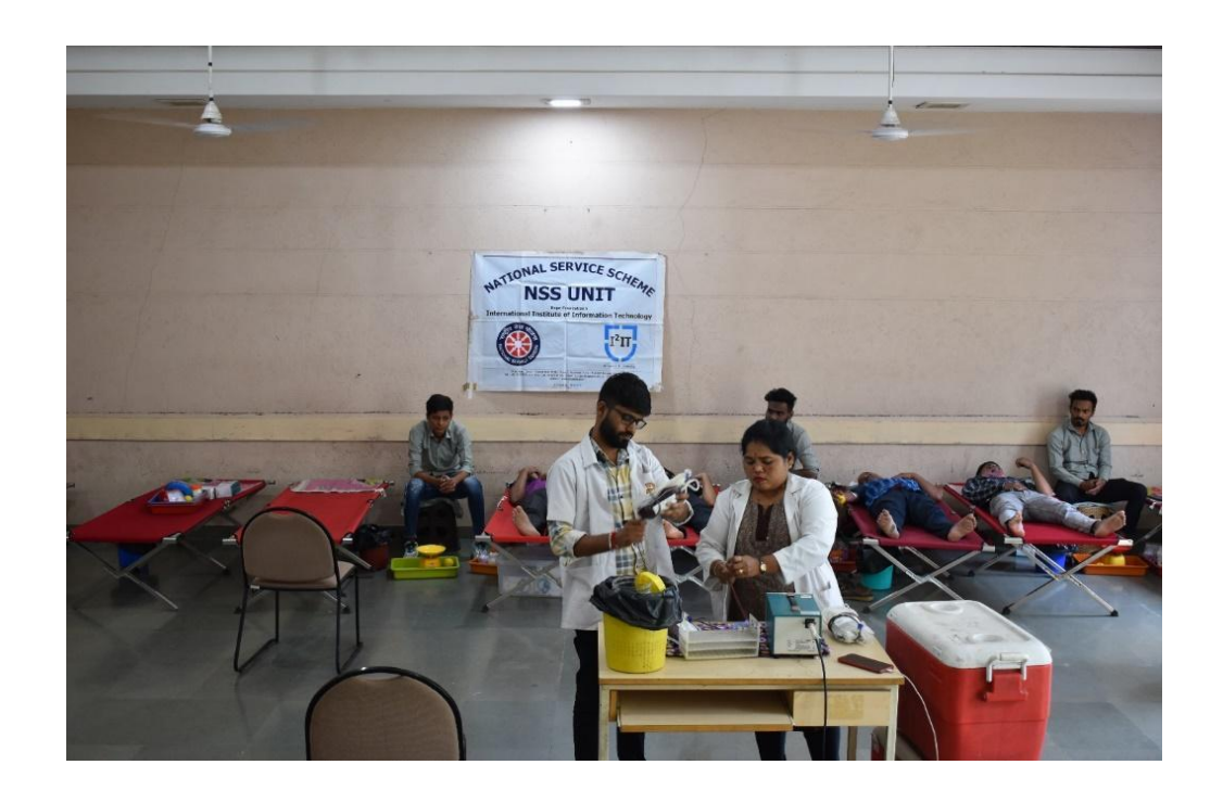
Students participating in Blood donation camp

Approved by AICTE, New Delhi | Recognized by DTE, Govt. of Maharashtra | Affiliated to the Savitribai Phule Pune University DTE Code: EN 6754 | AISHE Code: C-41681