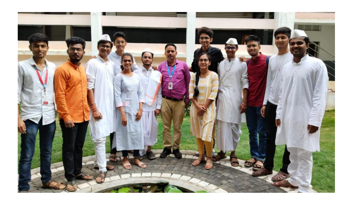
Students enthusiastically participating in Pandharpur Wari

Approved by AICTE, New Delhi | Recognized by DTE, Govt. of Maharashtra | Affiliated to the Savitribai Phule Pune University DTE Code: EN 6754 | AISHE Code: C-41681