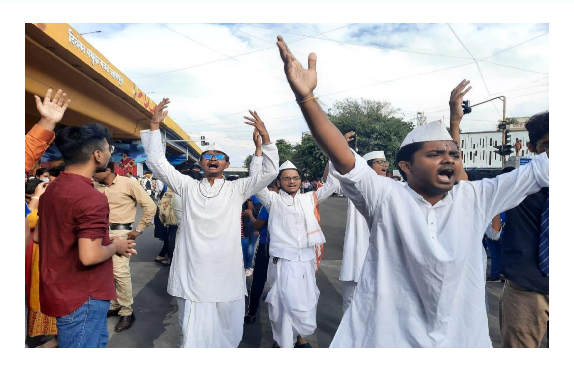
Students join Wari procession on Mumbai Pune Road

Approved by AICTE, New Delhi | Recognized by DTE, Govt. of Maharashtra | Affiliated to the Savitribai Phule Pune University DTE Code: EN 6754 | AISHE Code: C-41681