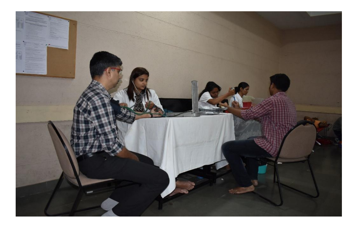
Staff members donating blood

The total 64 participants has contributed to blood donation camp successfully.