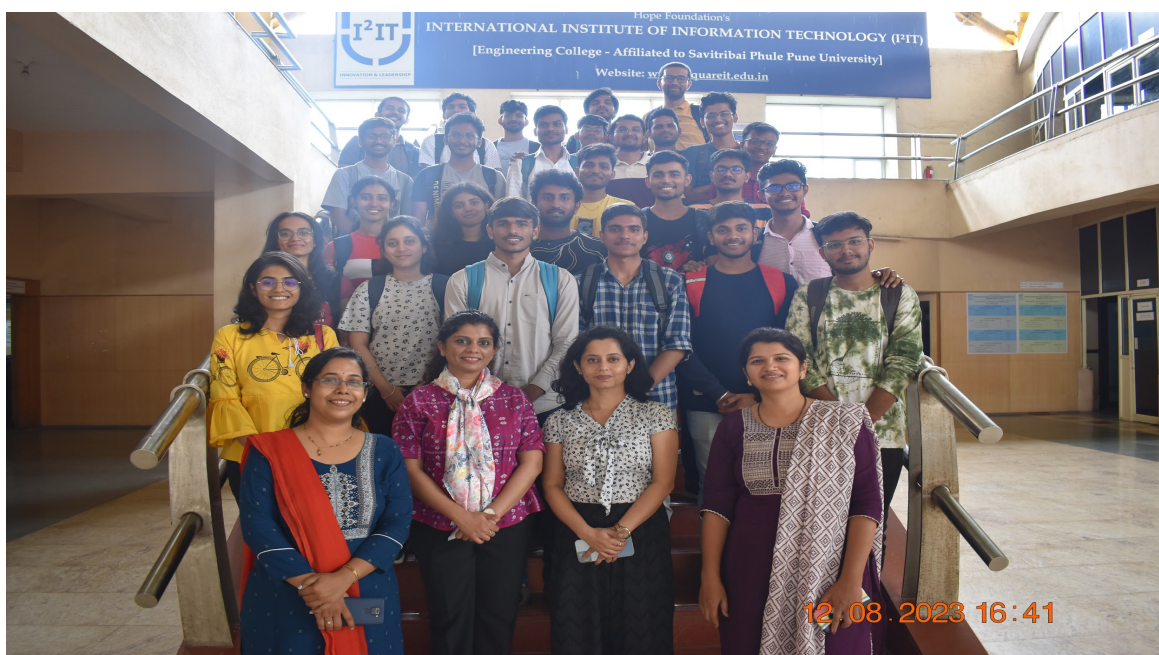
Group photo with participants, event Coordinator and Speaker