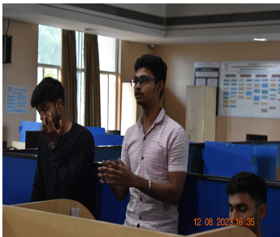
Students sharing the experience of the event