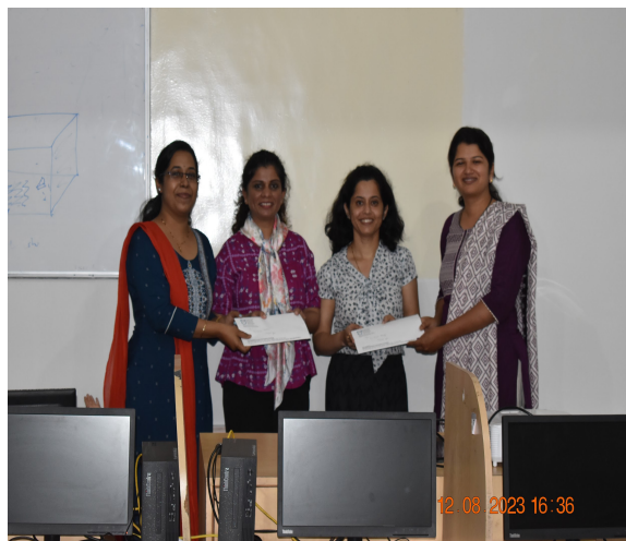
Felicitation with letter of Appreciation to the speaker