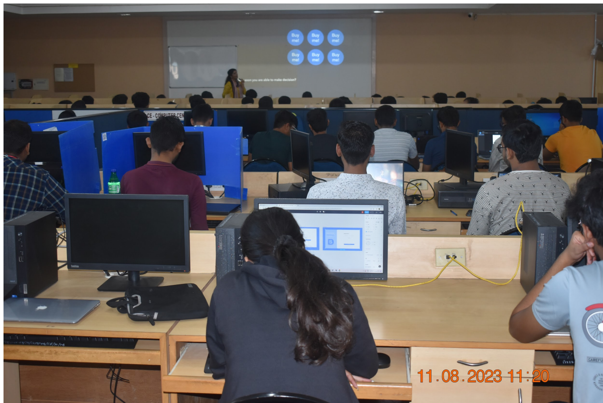
Students listening and practicing the exercises