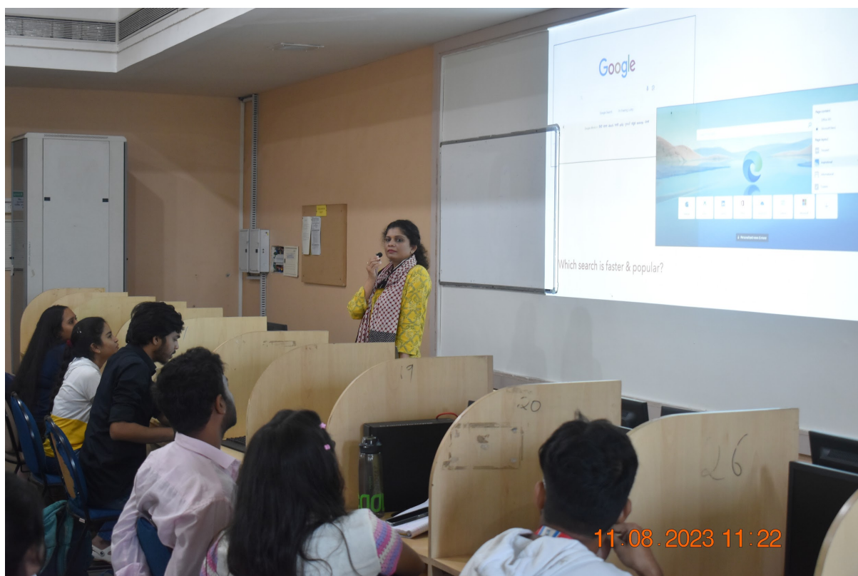
Resource persons solving the students doubts during the session