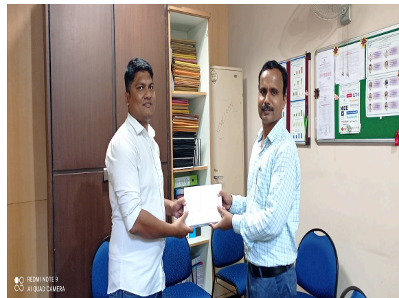
Day 2: While Head of the Department handing over the token of appreciation to speaker