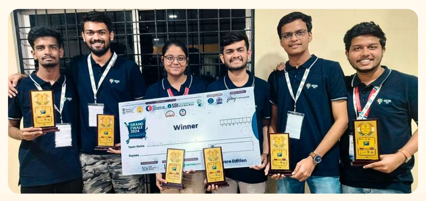
CONRATULATIONS TO THE GRAND FINALE WINNERS OF SMART INDIA HACKATHON 2024!