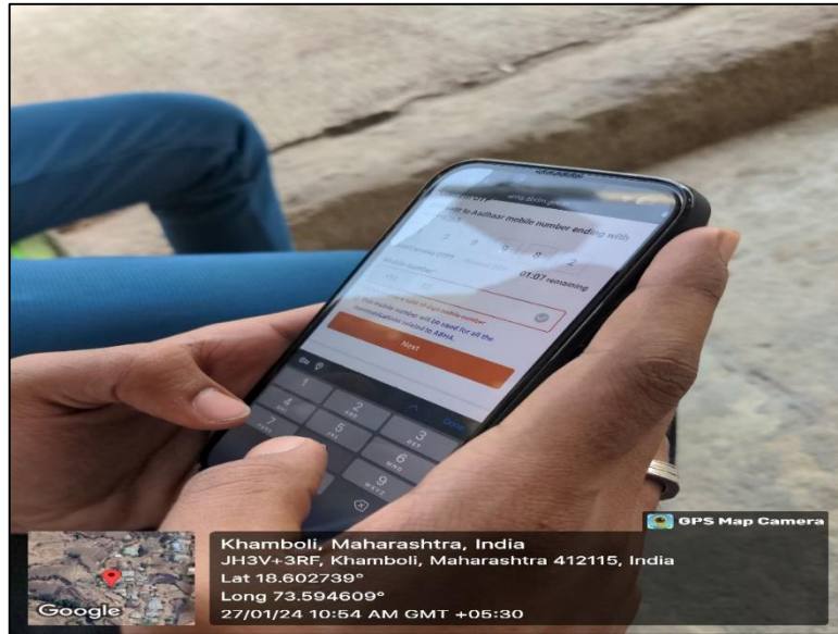
Photo 2: Aadhar card Upgradation processing on NSS volunteer's mobile