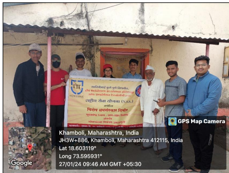
Photo 3: NSS volunteers After successful Aadhar card updation process