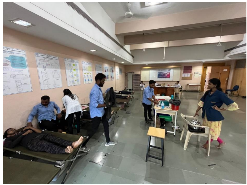
Photo 3: The Blood Donation Process in Action at Blood Donation Camp