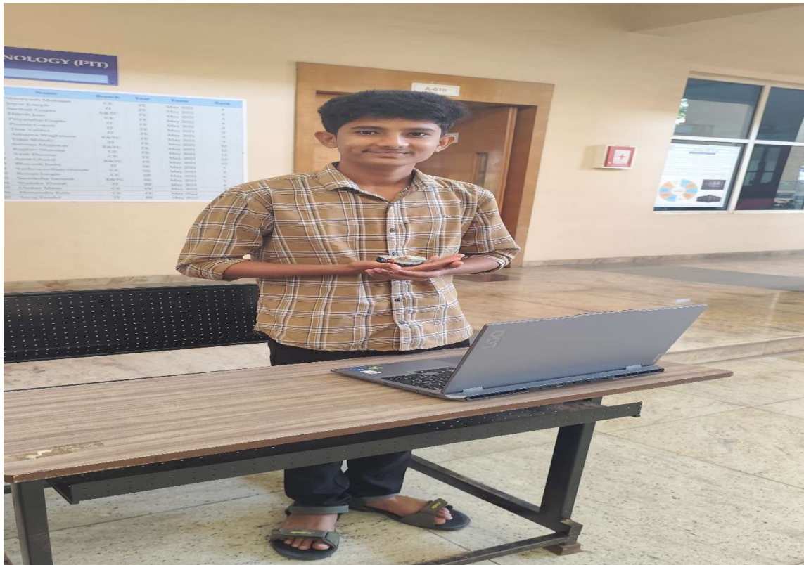
Photo2: Student exploring their ideas to audience