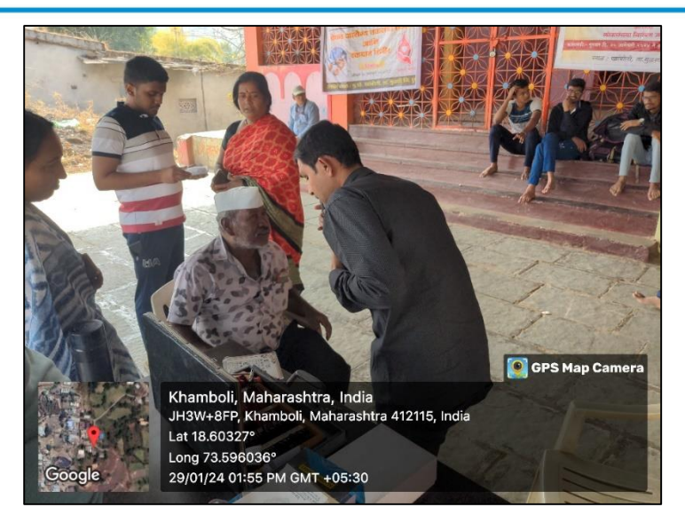
Photo 2: Villagers undergoing special Eye Check-ups with an Expert using various Lenses

Approved by AICTE, New Delhi | Recognized by DTE, Govt. of Maharashtra | Affiliated to the Savitribai Phule Pune University DTE Code : EN 6754 | AISHE Code : C-41681