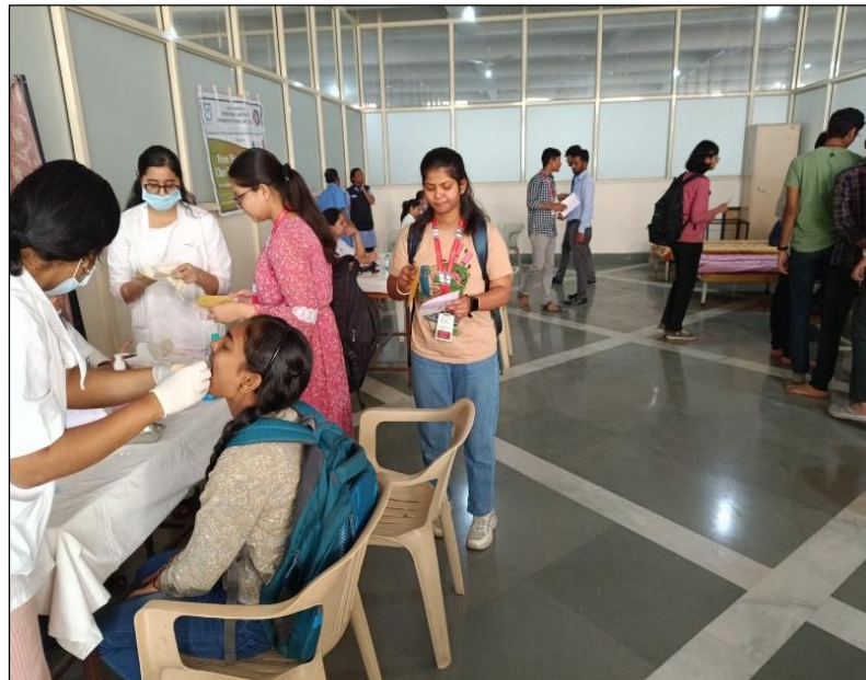
Photo 2: Students Receiving Dental Check-ups during the Health Camp