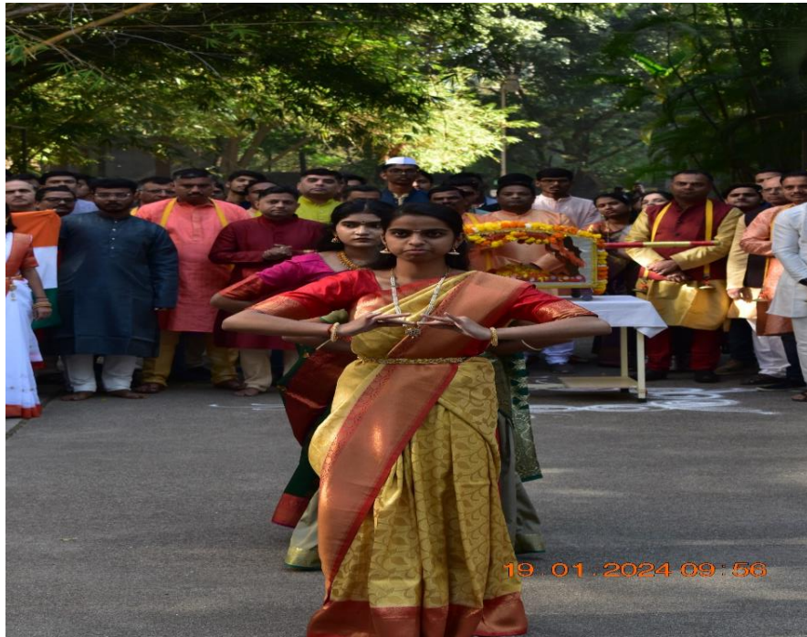
Photo 2: Bharatnatyam performance representing the culture of South India during the Granth-Dindi event