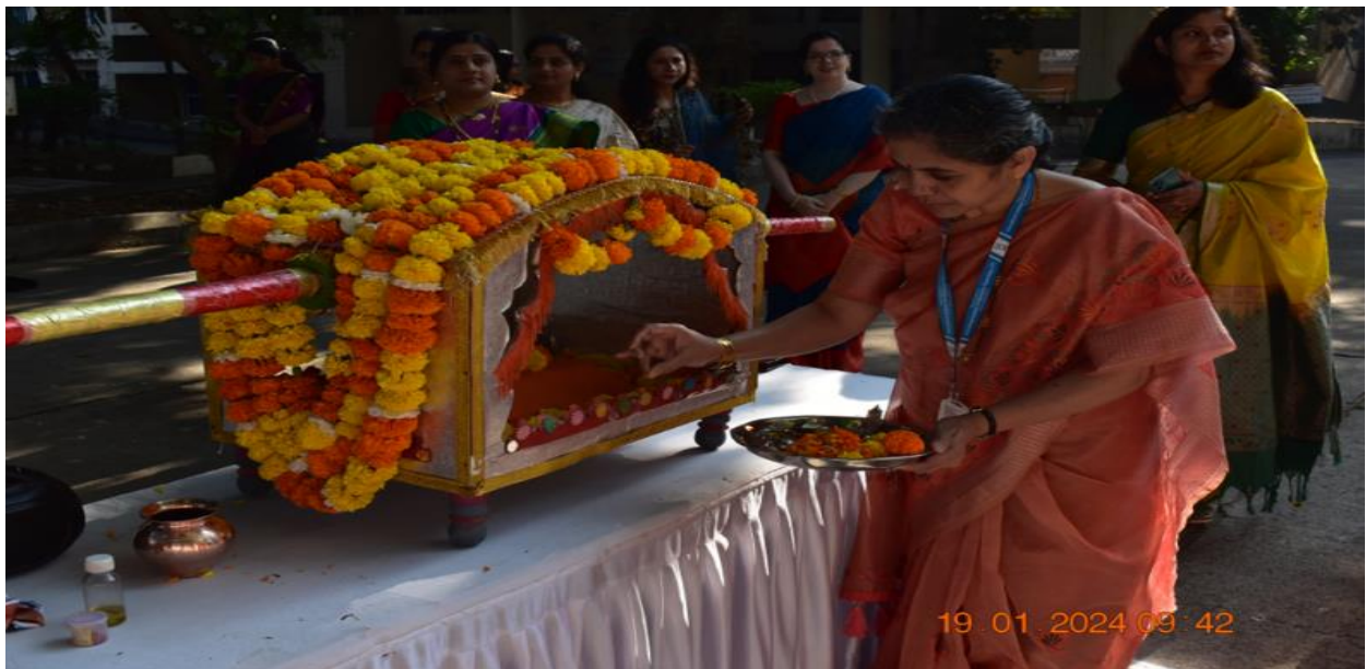
Photo 1: Principal Mam Initiating the Ceremonial Indication for the Palkhi (Granth-Dindi) Procession