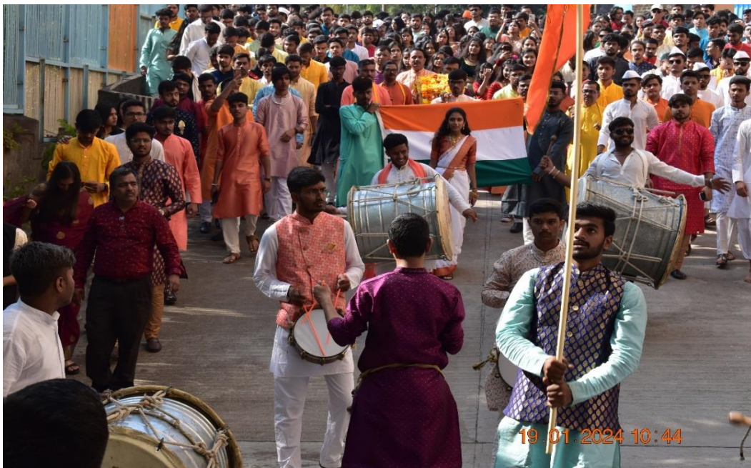
Photo 3: Dhol-tasha performance showcasing the vibrant culture of Maharashtra during the Granth-dindi