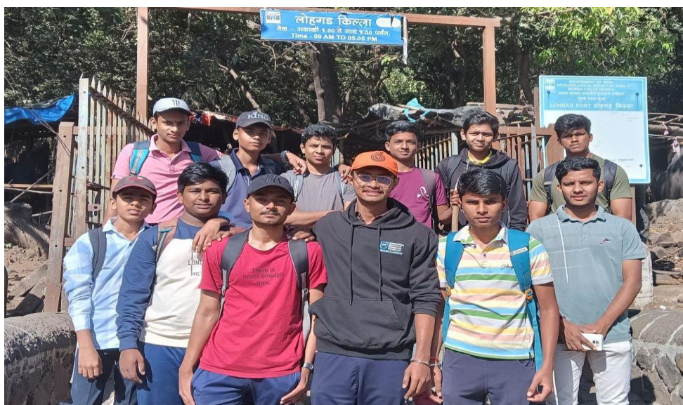
Photo 3: NSS volunteers at Lohagad Paytha during the clean-up initiative