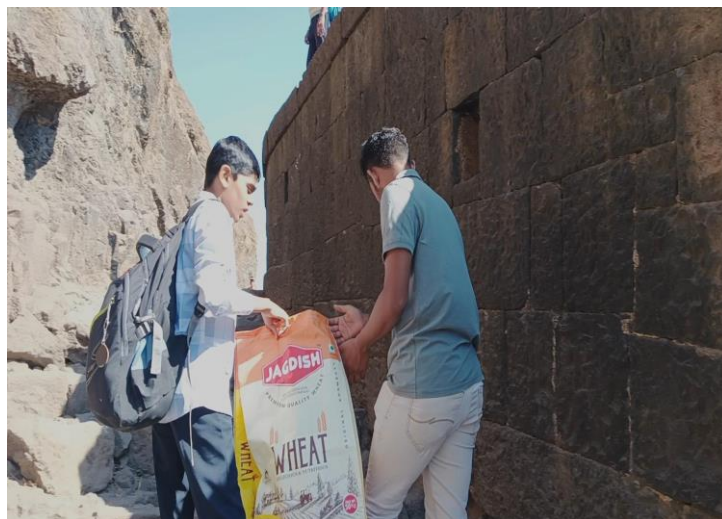
Photo 2: NSS volunteers collecting plastic waste at Hanuman Darwaja