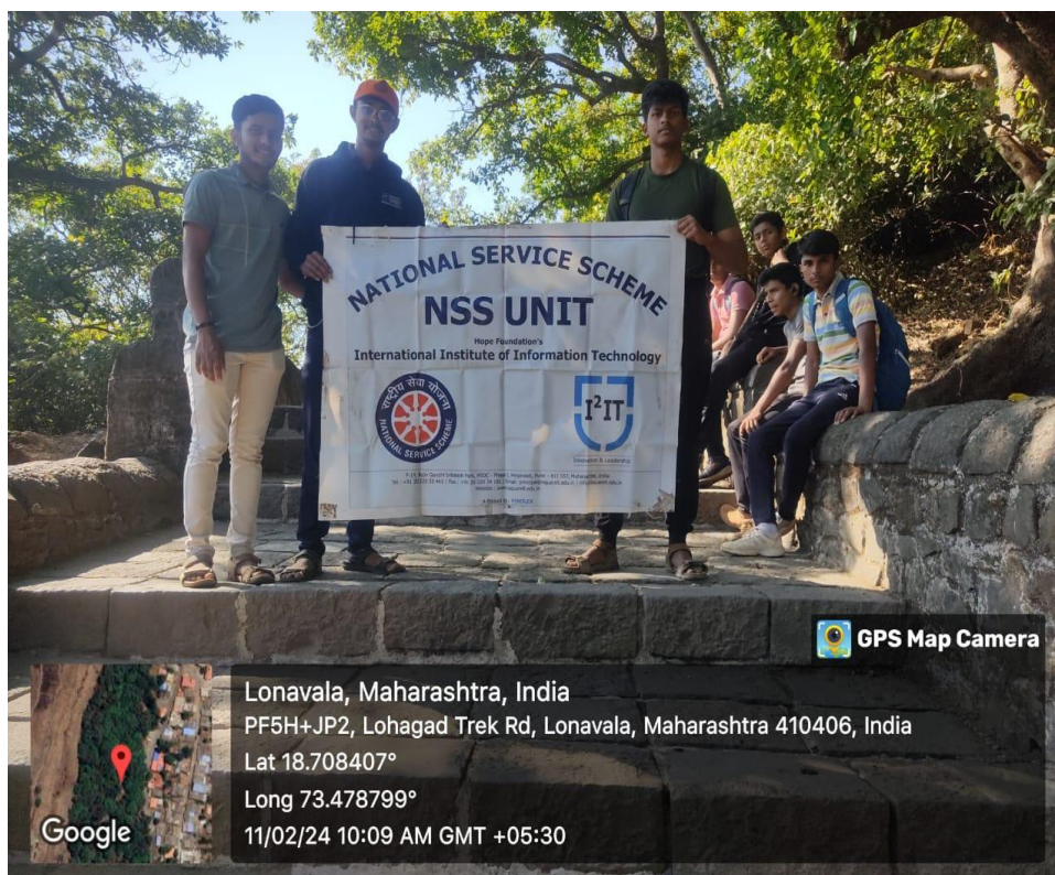
Photo 1: NSS Volunteers at the starting point of Lohagad Fort, ready to begin their clean-up mission