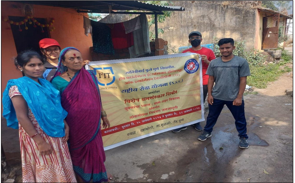
Photo 3: NSS volunteers After successful Ayushman Bharat card preparation process