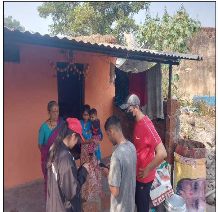
Photo 1: NSS volunteers with villagers during preparing of ABHA card