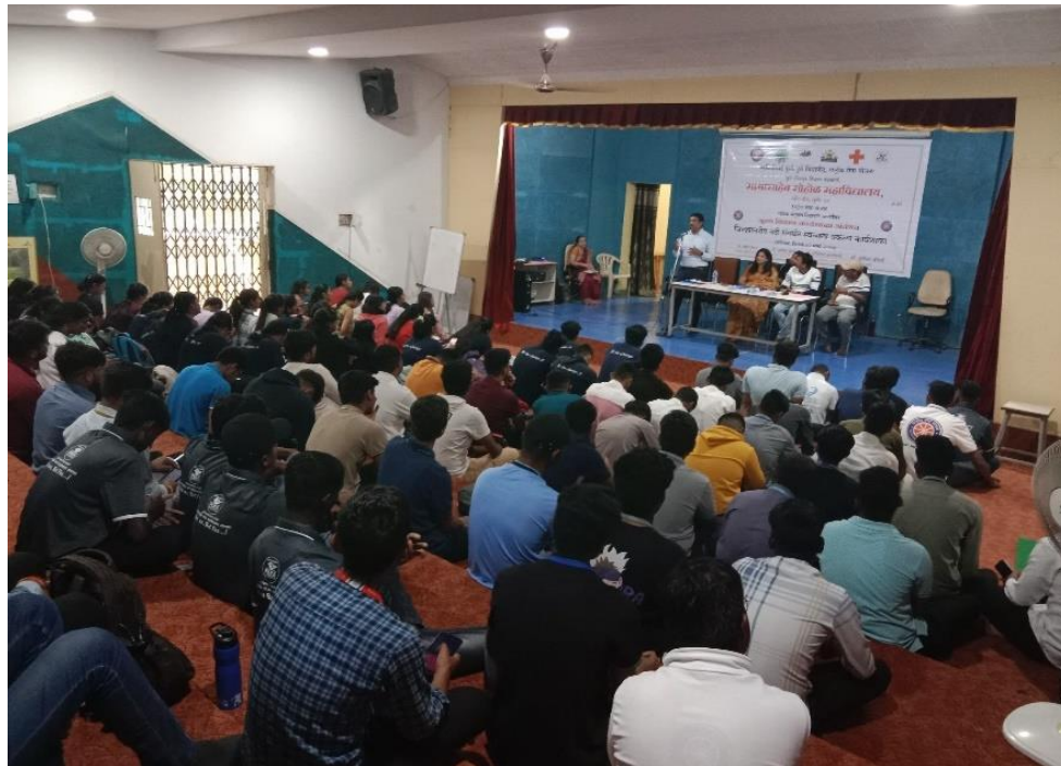
Photo 1: River Cleaning Awareness Session Conducted at Mamasahab Mohal College, Pune

Throughout the day, volunteers engaged in cleaning activities along the banks of the Mutha River, targeting areas known for high pollution levels. Equipped with necessary cleaning materials, such as gloves and garbage bags, participants diligently collected litter and debris, with a particular focus on plastic waste and bottles. Concurrently, awareness sessions were conducted to educate participants and passersby about the adverse effects of river pollution and the significance of sustainable river management practices. The program yielded tangible outcomes, with a significant amount of waste properly disposed of, contributing to the restoration of the river's ecosystem. Moreover, the event successfully raised awareness among participants and the wider community, highlighting the pressing need for collective action in addressing environmental challenges. The collaborative efforts between NSS SPPU, Mamasahab Mohal College, and International Institute of Information Technology, Hinjawadi, Pune underscored the pivotal role of youth-led initiatives in fostering environmental stewardship and advocating for the preservation of natural resources.