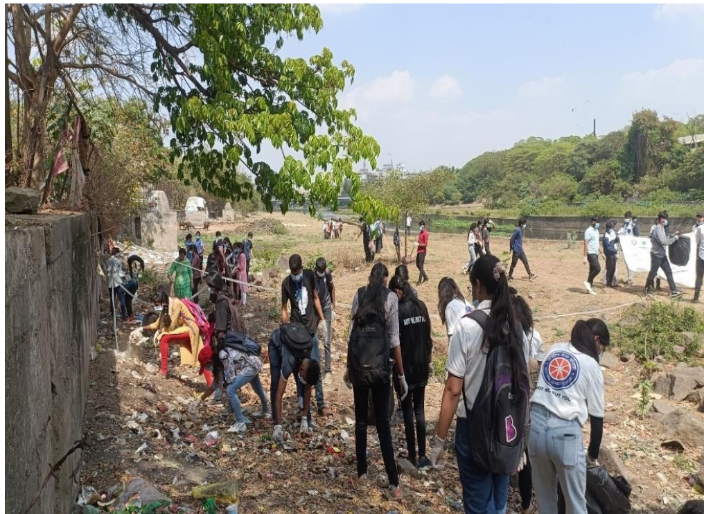
Photo 3: NSS Volunteers Actively Participate in The River Cleaning Process