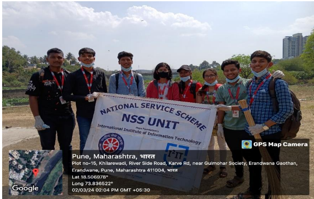
Photo 1: NSS Volunteers from Mamasheh Mohal College, Pune, Mobilizing for River Cleaning Activity