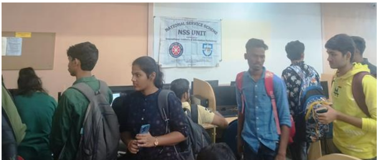
Photo 2: Blood bank staff assisting donors during the blood donation camp