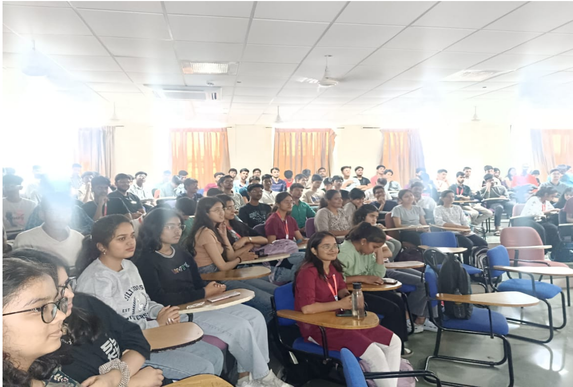
Event Photo 5: