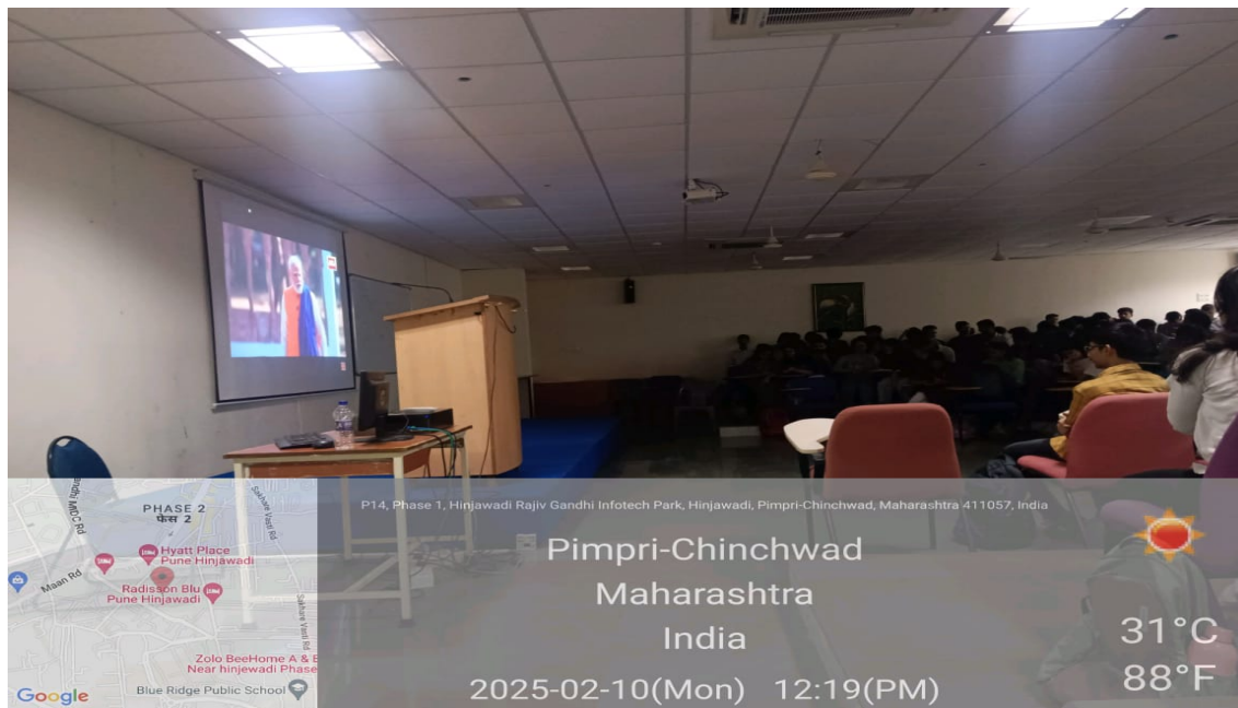
Event Photo 2: