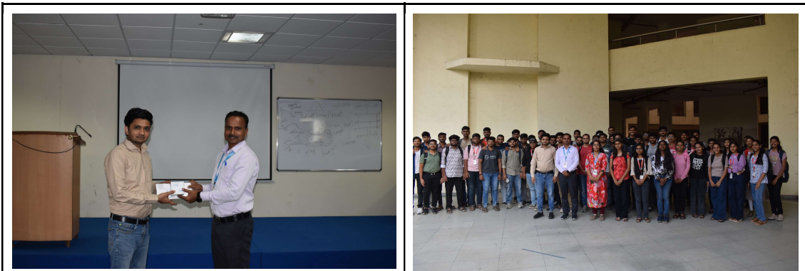
A group photos with Participants, front row Resource Person, HoD and Event Coordinator