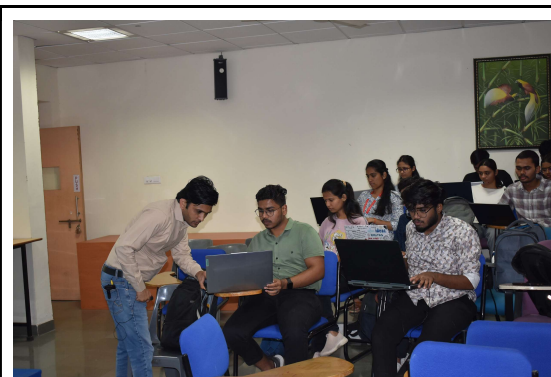
While speaker solving issues faced by students during the session