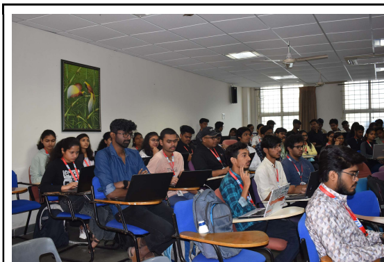
While Students listening to instruction given by Speaker and performing Hands-on