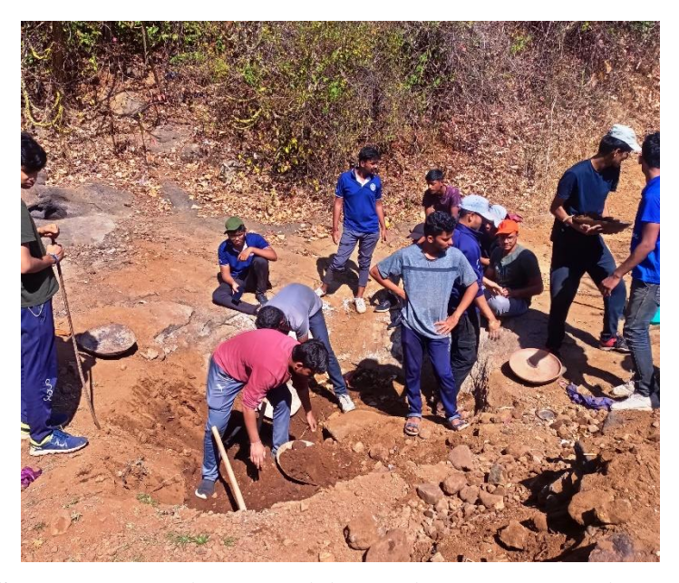
Photo 3: NSS volunteers actively participated in the construction process