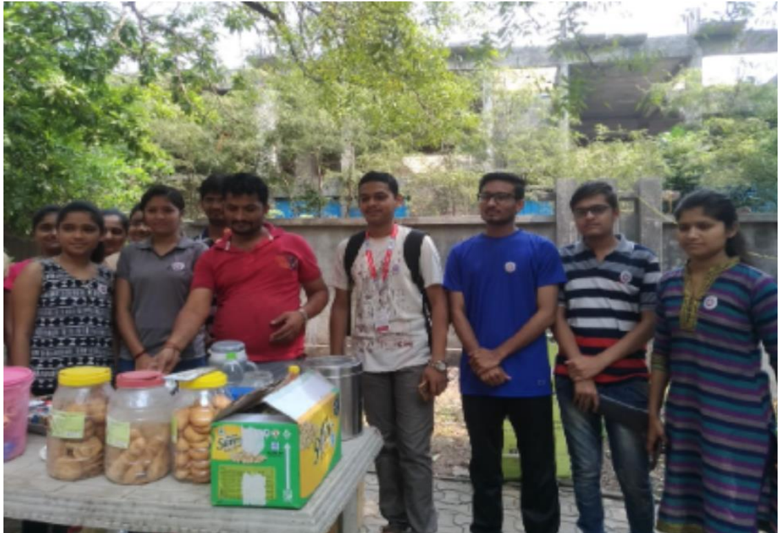
Photo 2: NSS Volunteers Demonstrating Effective Ways of Waste Disposal