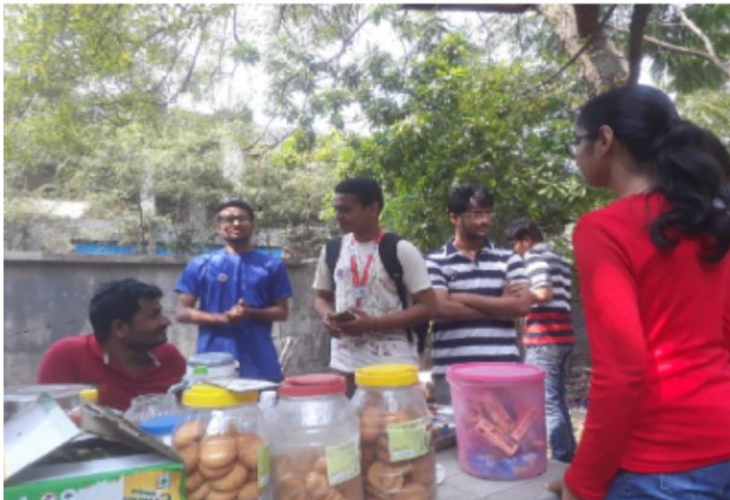
Photo 1: NSS Volunteers appealing vendors for clean stalls and maintaining hygiene on stall