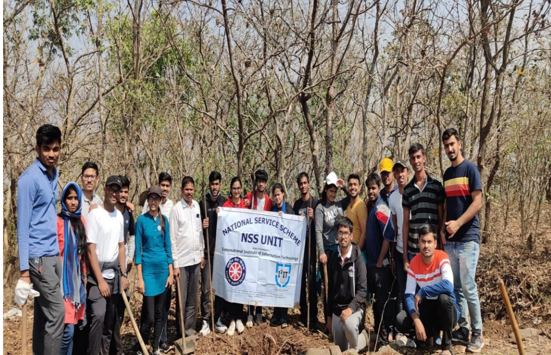
Photo 3: "Seeding Sustainability: Our Collective Effort in Tree Plantation"