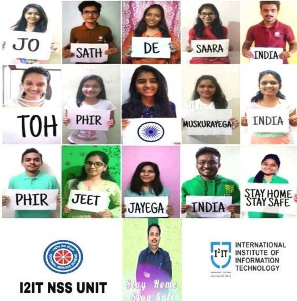
Photo: Stay Home Stay Safe message from NSS Unit