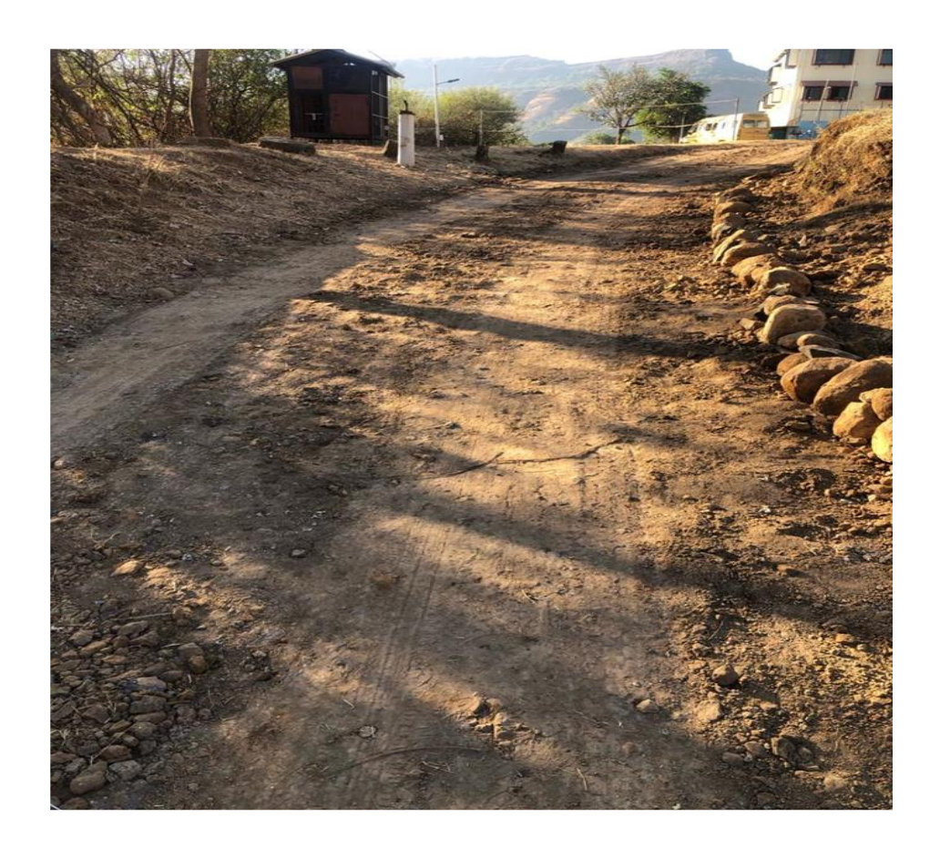
Photo 3: NSS Volunteers Successful repaired of key gravel road sections in Devale

Approved by AICTE, New Delhi | Recognized by DTE, Govt. of Maharashtra | Affiliated to the Savitribai Phule Pune University DTE Code : EN 6754 | AISHE Code : C-41681