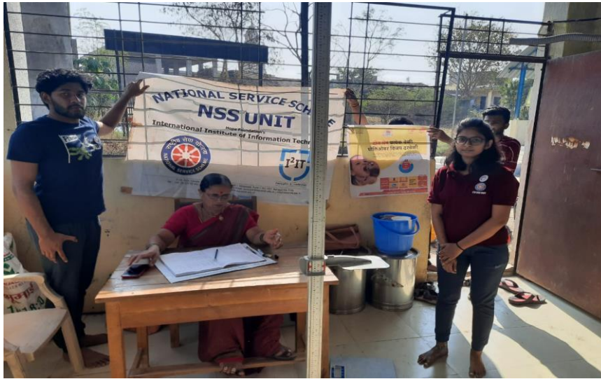
Photo1: "NSS Volunteers help in polio drive"