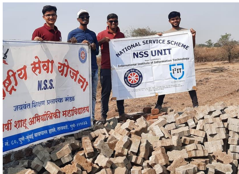
Photo2: “Complete The Task of Tidying Up Messy Pavers”