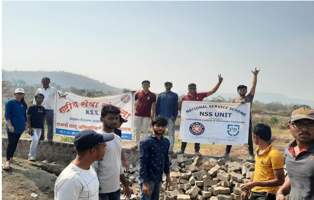
Photo3:"Happy Students: Task Completed"