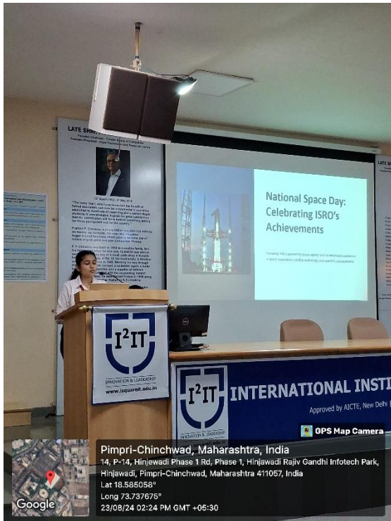
Photo 1: Introduction to National Space Day. Presenting various videos on the ISRO and space research.