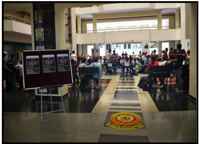
Some Glimpses of Project Exhibition and Competition