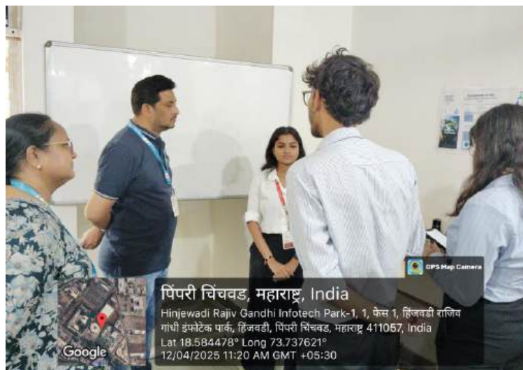
Jury evaluating the poster