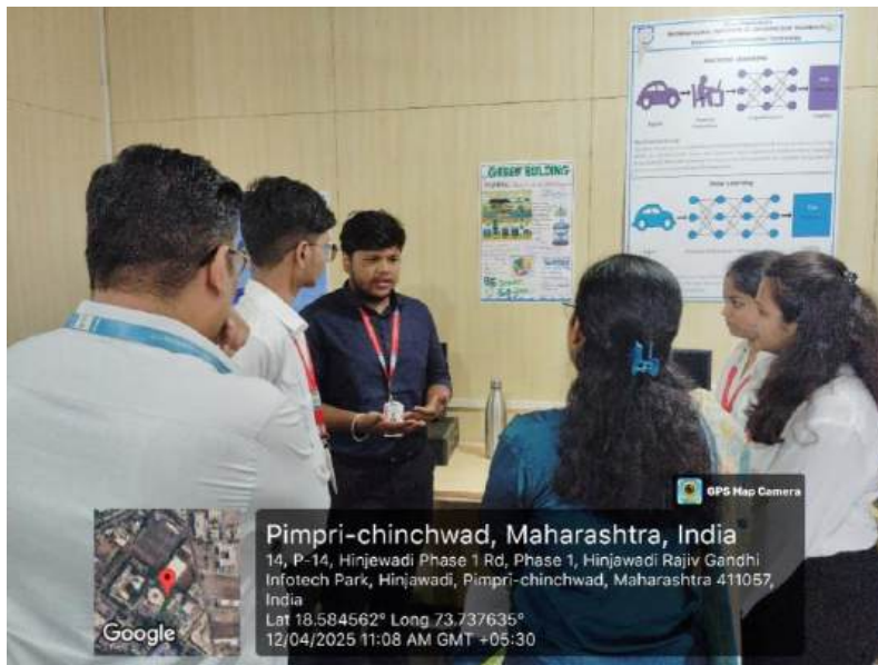
Jury evaluating the poster