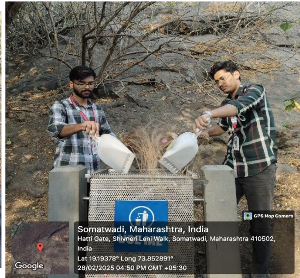
Photo 3 : All Members after successful cleanliness and conservation drive